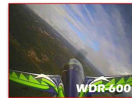
*Prop comparison images simulated

Ultra Low Light Performance - Excellent low light performance is thanks to the Sony Super HAD II CCD sensor, with 0.1 lux natively and 0.00001 lux with sensitivity enhancement. Unlike other WDR cameras on the market the WDR600 switches to single scan once the low light threshold is met.