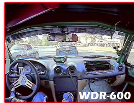
*Side-by-side test was performed under identical conditions using the same recorder and settings.

Image Stabilization - Built-in electronic image stabilization provides a crisp stable image in the most vibration intense environments. After nearly a decade of development in vibration mitigation and image stabilization, we are proud to offer one of the most stable solutions available.