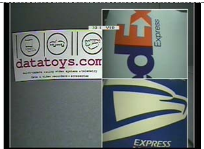
Video Mode 6