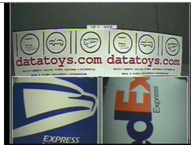
Video Mode 5