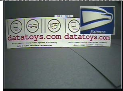
Video Mode 15