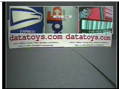
Video Mode 4