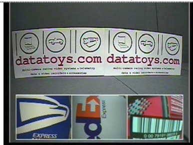
Video Mode 1

To activate: press and hold VID button for 2-3 seconds until SET VID label appears on the screen, indicating that you have entered program mode. Pressing VID button selects next mode, as shown below.