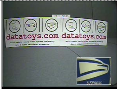
Video Mode 13