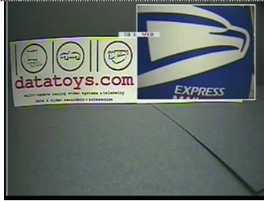
Video Mode 11