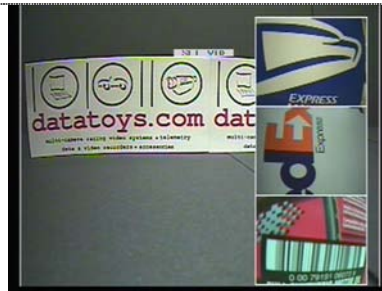
Video Mode 2