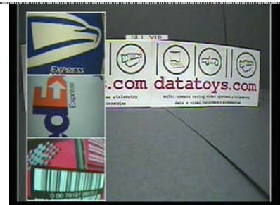
Video Mode 3