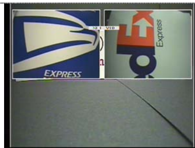
Video Mode 8