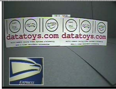
Video Mode 14