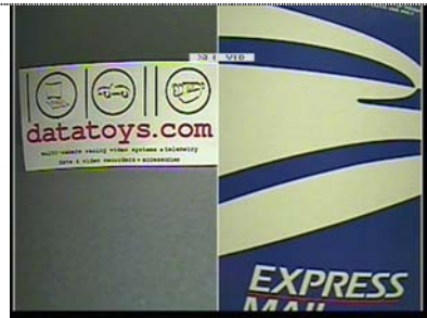
Video Mode 18