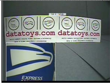
Video Mode 10