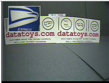
Video Mode 16