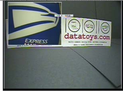
Video Mode 12