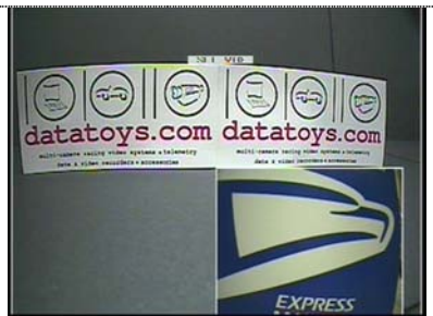
Video Mode 9