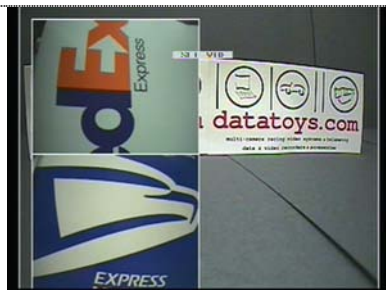
Video Mode 7